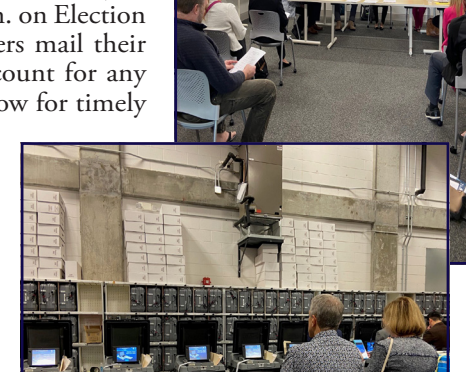
Earlier this month, our team conducted the Logic & Accuracy Test for the upcoming Presidential Preference Primary. As expected, our equipment tabulated test ballots with 100% accuracy.

As always, the Supervisor of Elections office is THE trusted resource for election and voting information in Collier County. Stay up-to-date with our office by following us on our social platforms and subscribing to our monthly newsletter.